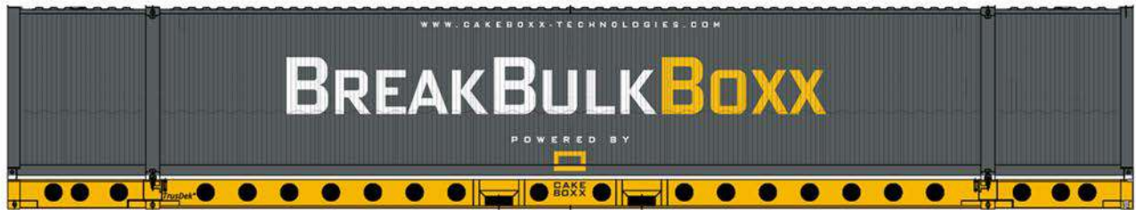
BreakBulkBoxx 53', flat floor model

The circular lightening holes in its deck (the lower portion of the two-piece container), are incorporated to reduce weight. The thoughtful design also includes dual gooseneck tunnels for versatile transportability and a new 'end locking system' for additional security and strength to complement its characteristic Vertical Locking System at the 40' intermediate position.