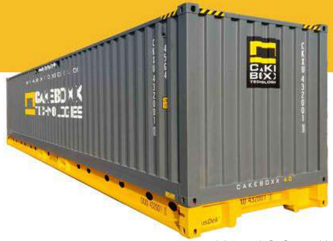
CakeBoxx 40', flat floor model

This CakeBoxx integrates seamlessly into all intermodal processes, including stacking, storage, terminal transfers and ship, rail and truck haulage. CakeBoxx 40' comes as standard in high cube 9'6" height. Other heights available on request.