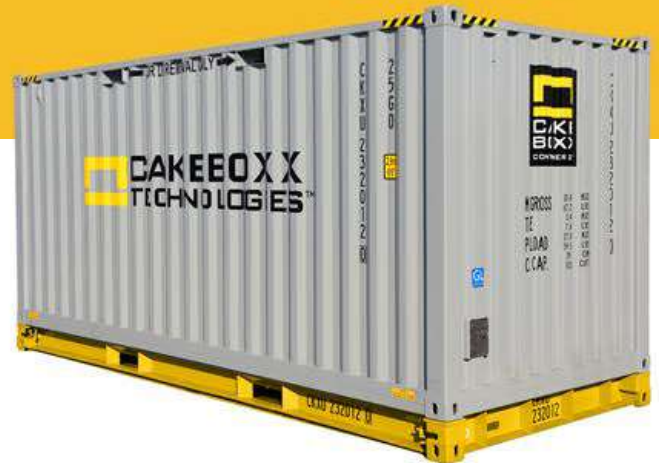
CakeBoxx 20', flat floor model

This CakeBoxx integrates seamlessly into all intermodal processes, including stacking, storage, terminal transfers and ship, rail and truck haulage. CakeBoxx 20' comes as standard in high cube 9'6" height. Other heights available on request.