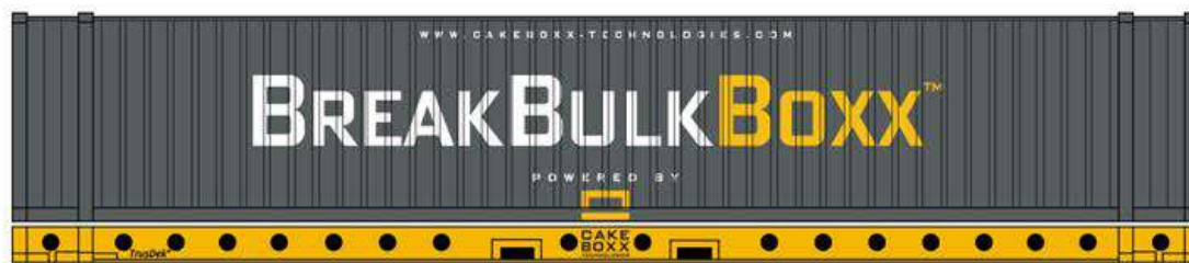
BreakBulkBoxx 45', flat floor model

The circular lightening holes in its deck (the lower portion of the two-piece container), are incorporated to reduce weight. The thoughtful design also includes dual gooseneck tunnels for versatile transportability and a new 'end locking system' for additional security and strength to complement its characteristic Vertical Locking System at the 40' intermediate position.